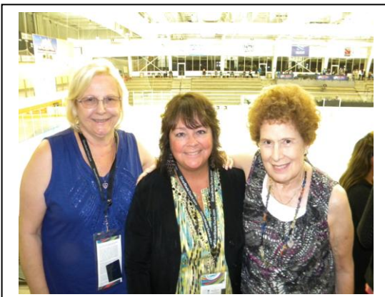
International FS Classic-Salt Lake City, UT